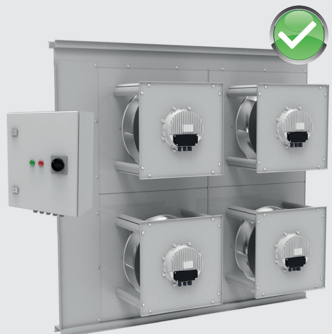
Efficient ECFanGrid as retrofit solution for the replacement of e.g. older belt driven fans. The ECFanGrid Retrofit KIT includes all mechanical parts: fans, cabinet, grid and screws.